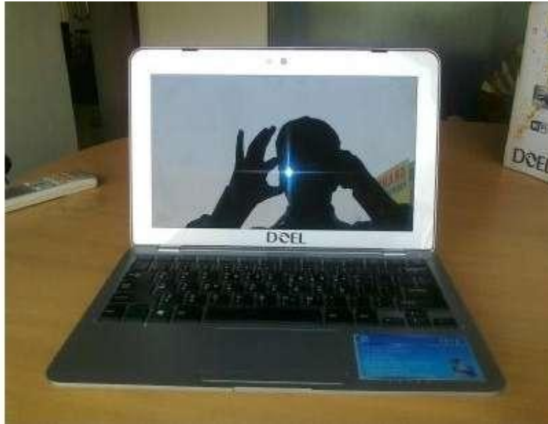
One of the DOEL laptops unveiled

Now, getting down to business. What is packed within these $130 DOEL laptops? According to a report on DotNews , four models of the DOEL laptops, namely - Model 2102, Model 0703, Model 2603 and Model 1612 have been launched.