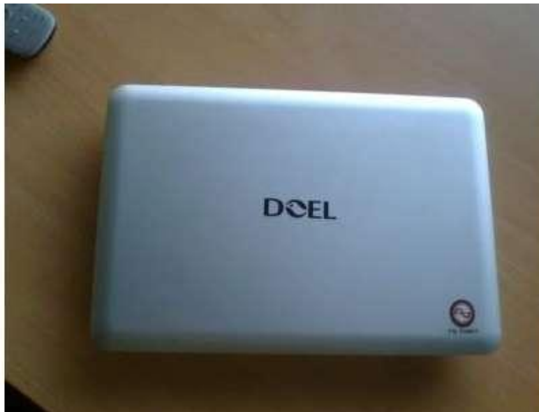
Bangladesh's $130 laptop

C lose on the heels of the launch of a $35 tablet in India, news of the launch of a $130 laptop being unveiled begun surfacing. According to a BBC report , this time it's not India, but neighbouring Bangladesh who's just witnessed the launch of its first-ever laptop for all of $130 (10,000 taka), which brings its price in rupees to roughly Rs. 6,500. The laptop, named DOEL was unveiled on Tuesday by the Bangladesh Prime Minister, Sheikh Hasina, at a ceremony in Dhaka. The DOEL laptops are being produced by the state-owned telecoms company, Telephone Shilpa Sangstha (TSS). For now, the TSS would be producing four models of the DOEL laptops.